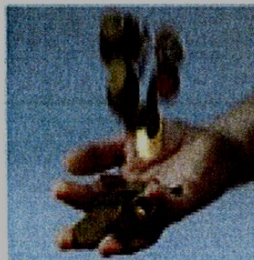
1 of 1 Full Size